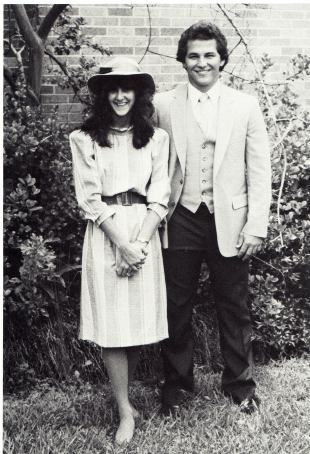
SENIOR CLASS FAVORITES